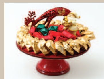
> Christmas arrangement

This year, chocolate production has reached new record of 2300kg. The company has participated in Christmas sales of the Institut Français and Les Créneaux.