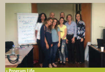
> Program Life

In accordance with the agreement between AEP and USAID, as part of the Palladium Life program, the Association received $16,600 for 2017 and $21,000 in all. In collaboration with USAID, to develop AEP's performance, two new delegates will be appointed, the first to West Bekaa and the second to the South. The program will also finance staff training and new software.